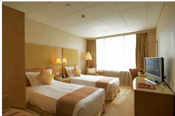
Standard Twin Share Rooms