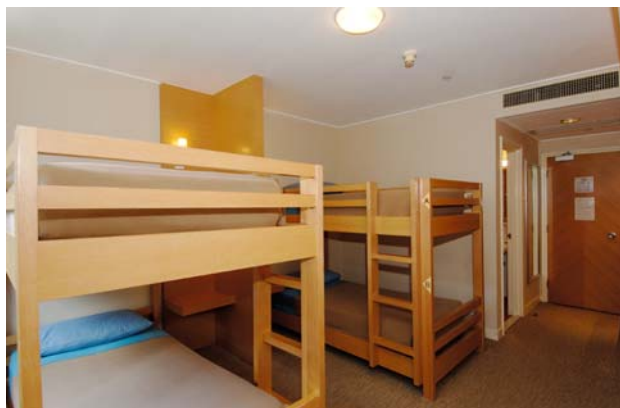
Bunk Bed Rooms – 4 bunks/room

YMCA – The Salisbury room request forms are placed at Appendix F – YMCA “The Salisbury” Hotel Booking Form