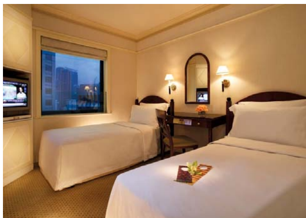
Standard Twin Share Rooms